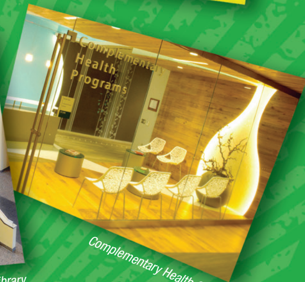
Complementary Health Clinic