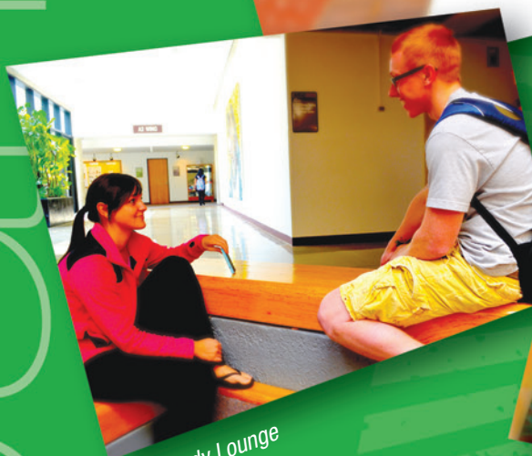
Quiet Study Lounge