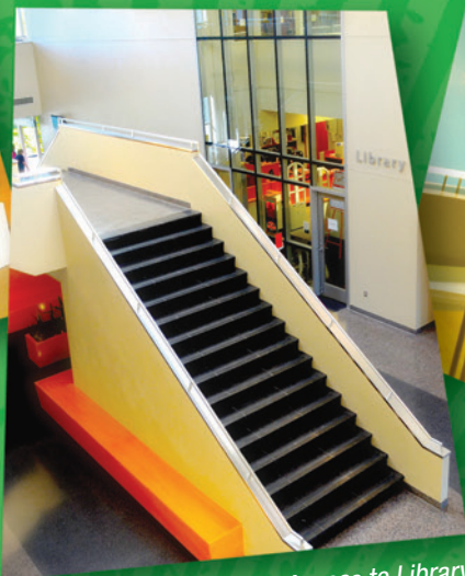
Atrium Access to Library