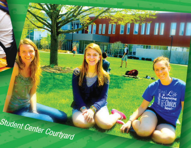
Student Center Courtyard